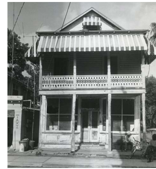
Old St. Francis House