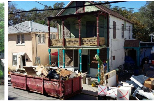
2016 after Hurricane Matthew