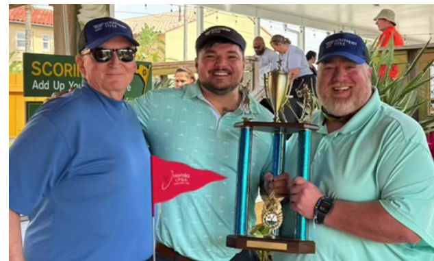
Round 1 Winners and Grand Champions, Southern Title