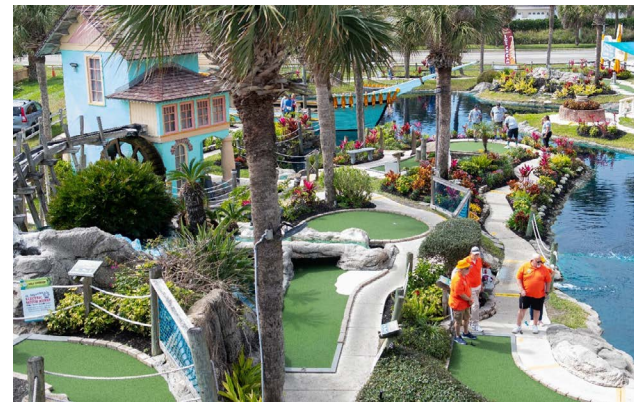
A beautiful day for the Swing into Action tournament at Fiesta Falls Miniature Golf